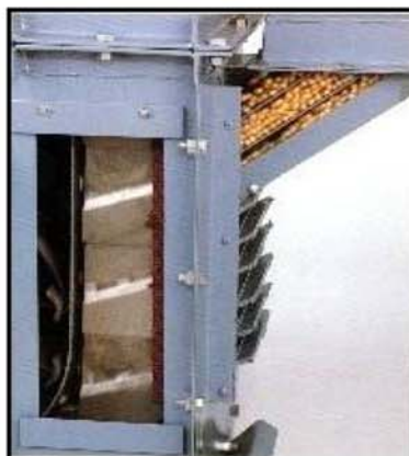
Louvered Inlet w/ Side Skirts to Maximize Cup Fill Efficiency & Minimize Product Damage in Boot