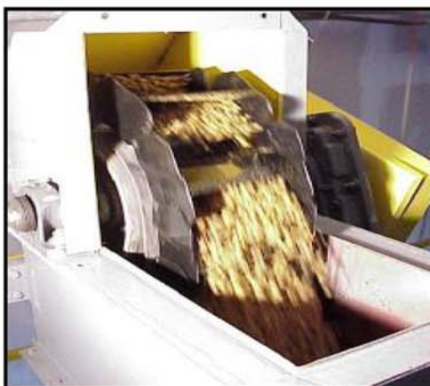
Extremely Gentle Product Discharge with Interlocking "Plastic-Coated" Steel or SS Cups